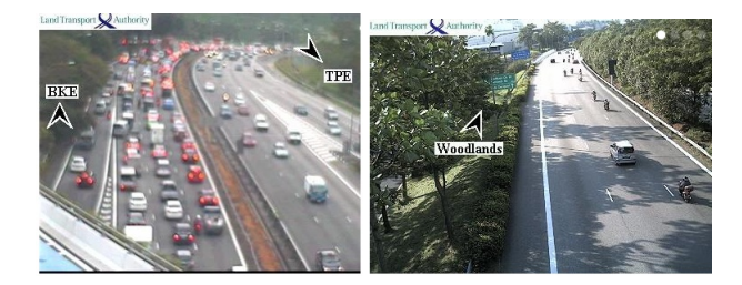
Figure 2: Examples of Traffic Image.

We utilize images from forty-nine stationary traffic cameras spread across Singapore. Each image has an ID, creation date, location (based on camera position), and a URL to a static image taken at the current time of the day. For each image, the Image Parser creates a RawImage object based on these attributes and stores the objects into the RawImage collection in the database. Figure 2 shows two traffic instances from two different cameras.